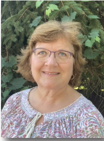
Mrs. Becky Blank Middle School